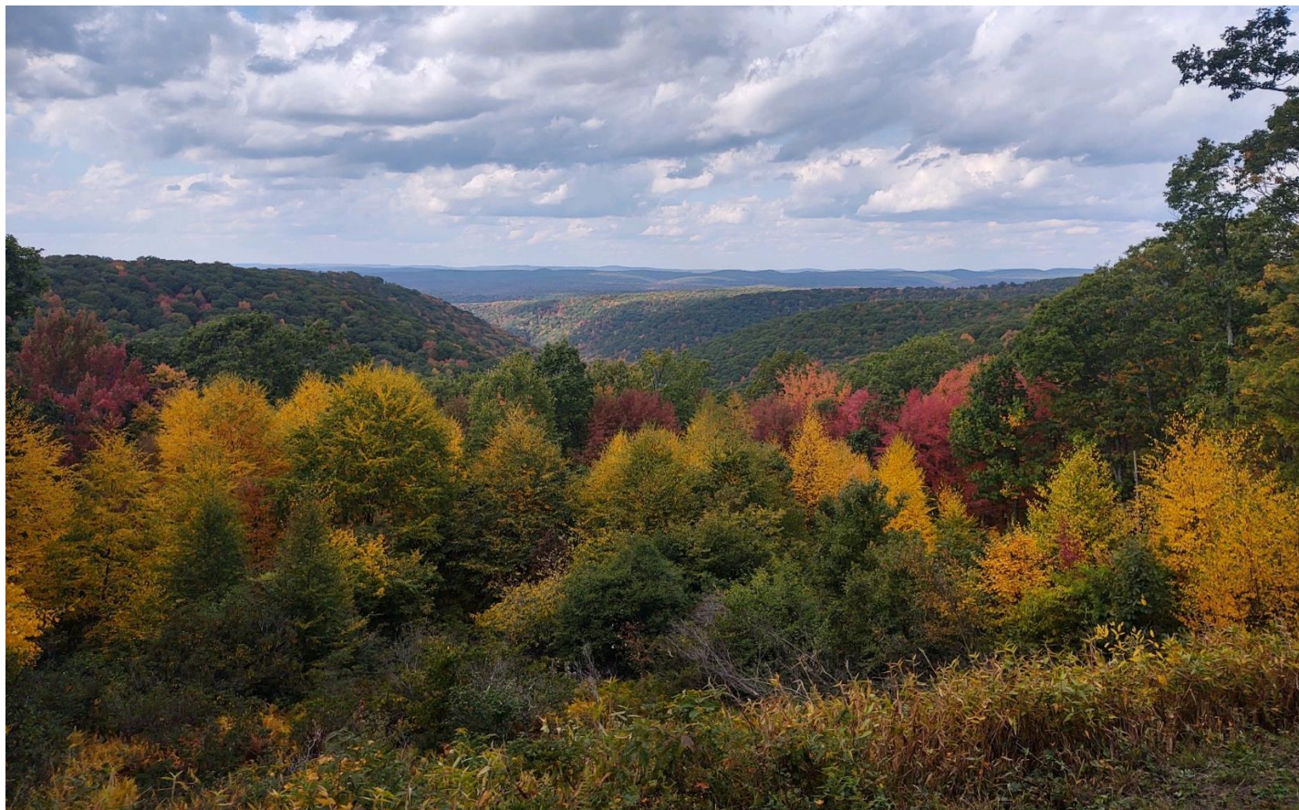
Brilliant foliage along a vista on Ridge Road, Cameron County