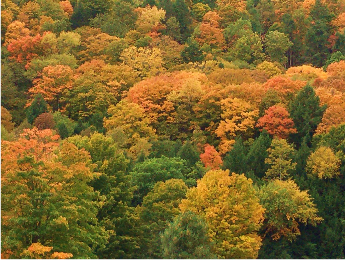
Tioga State Forest near Stony Fork.