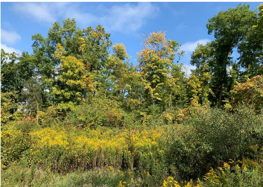
Nice fall colors are showing in Rothrock State Forest.

In Weiser State Forest District, observers in Lebanon and Dauphin counties have noted slow progress of foliage in the region, probably due to warmer temperatures last week. Recent rainfall could extend the peak season, which is still a few weeks away. Fall color is more advanced toward the northeastern end of the district in Schuylkill and Carbon counties. A scenic drive up Route 443 will reveal some good, early fall color.