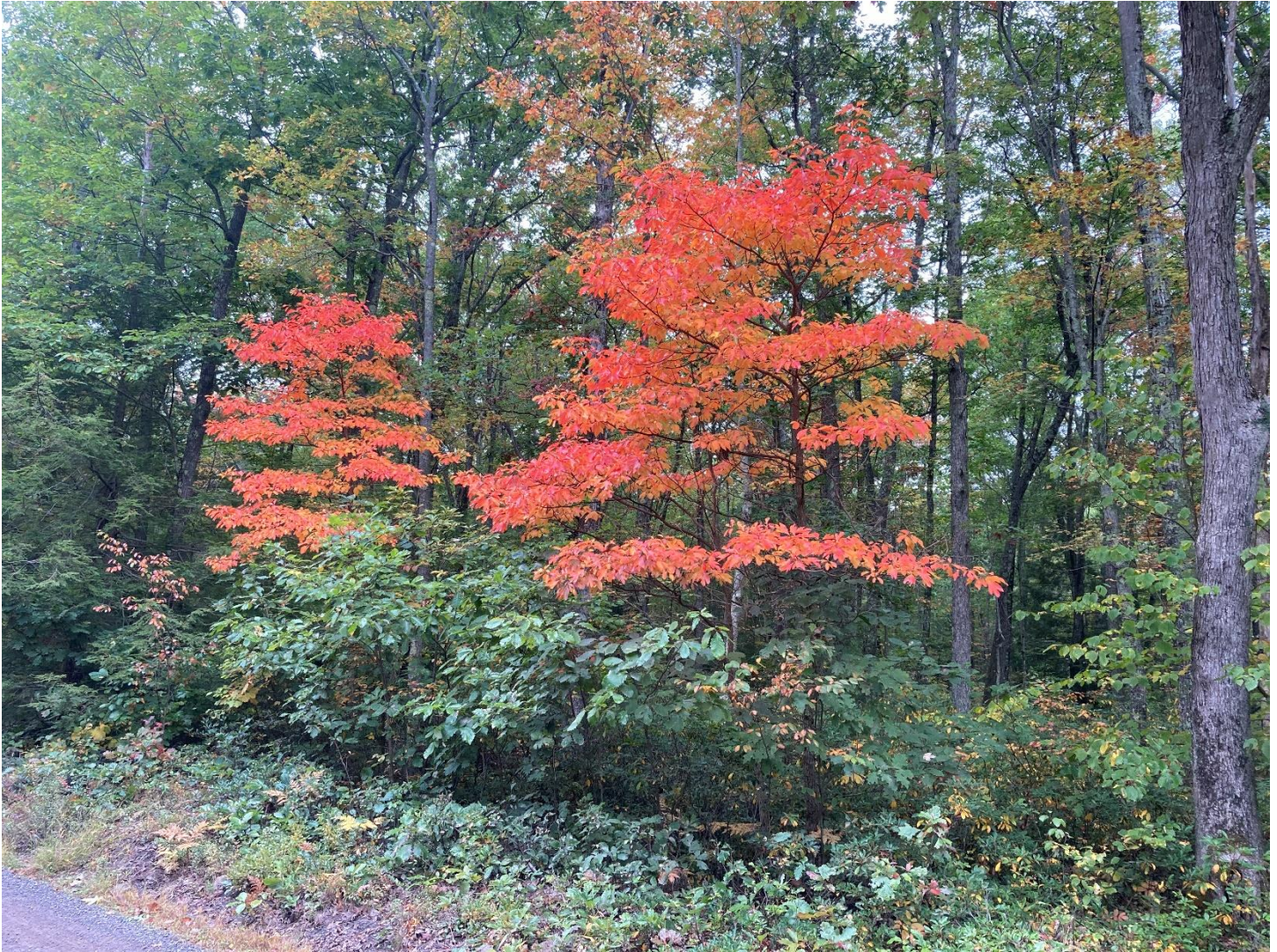
Bright sassafras in Delaware State Forest.

Foresters in Delaware State Forest reported the cooler nights last week strongly pushed fall color. Most changes are occurring in the northern hardwood forests. Some sugar and red maples are almost at peak and will only improve next week. In the oak forests, trees are still green but vibrant red and orange colors can be seen on sassafras and black gum. Many birches are also peaking, adding bright colors of yellow before they fall. The best places to view fall foliage in the coming days are in the Tobyhanna State Park area, the Promised Land State Park area, and along Route 390.