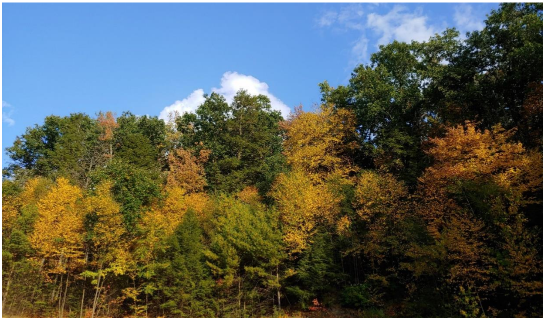
Beautiful color is spreading throughout Bald Eagle State Forest.

The Mifflin/Union County service forester (Bald Eagle State Forest) reported that a recent frost has pushed early leaf drop. Walnuts and other trees in the valleys are yellow. On the slopes, sugar maples are orange, and red maples, sassafras and huckleberry/blueberry are reddish. Poplars, and birches are adding shades of yellow. In the southern reaches of the district near Seven Mountains, foresters report a color “explosion”. Along US 322, red, yellow, and orange from common indicator trees suggest that fall is here. Among these are black gum, maples, sumac, sassafras, cherry, and aspen; which are painting a wide palette in the region. Peak color in this area is expected toward mid-October.