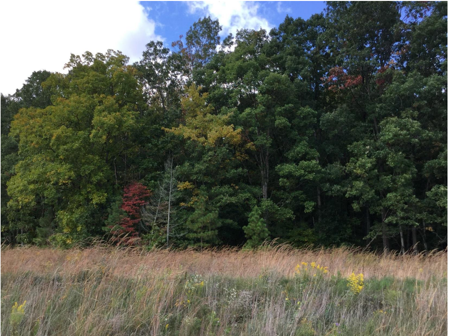
Early color in Buchanan State Forest.

In Buchanan State Forest (Franklin, Fulton, Bedford counties), not much has changed since last week. A few black gums and birches are showing color. Any state forest road along ridgetops would be a good place to take a drive to observe fall foliage, currently. With the forecast calling for colder temperatures this week, next week should mark a notable increase in fall color.