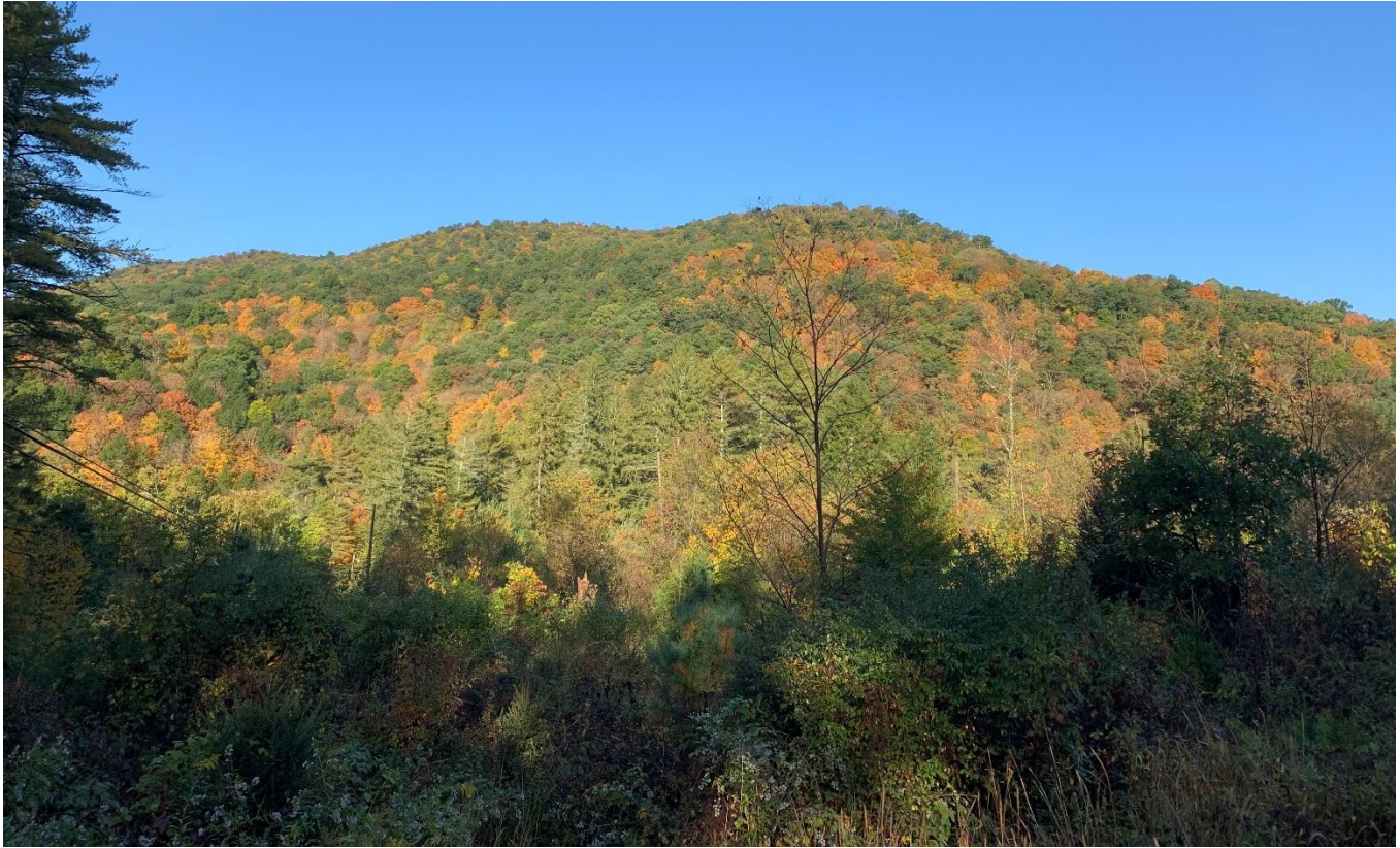
Fall colors are just beginning in Tuscarora State Forest.

The Perry/Juniata County service forester (Tuscarora State Forest District) reports that the district is mostly green, but some nice colors can be seen. Walnut trees have yellowed along with birch, poplar and maples. Many state forest gated roads are open now, offering more fall foliage views. Cool nights will cause trees to change quickly and colorful views will be afoot in the coming weeks.