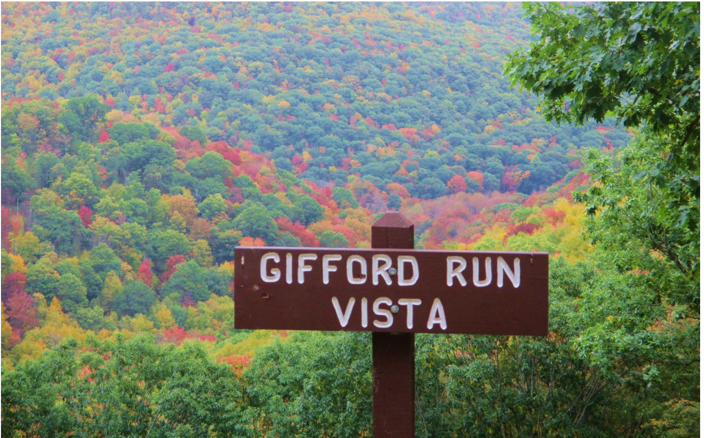
Gifford Run Vista, Moshannon State Forest

Color in Loyalsock State Forest (Lycoming, Sullivan, Bradford counties) has changed quickly over the last week and is progressing toward peak. Most maples are showing flaming scarlet, orange, and yellow leaves. Birches are bright yellow, and beech and oaks are mostly green. For a spectacular view, try hiking Rough Hill Trail from the Sandy Bottom Access Area along Route 87 south of Hillsgrove. Rough Hill Vista offers a spectacular view of the foliage along Loyalsock Creek.