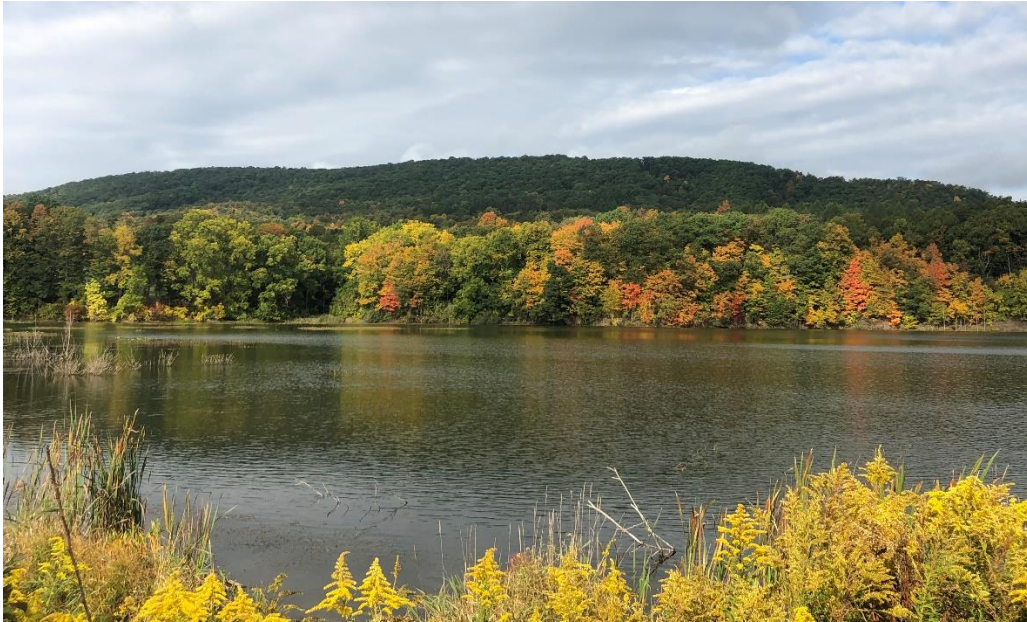
Pleasant fall color along Colyer Lake.

The Mifflin/Union County service forester (Bald Eagle State Forest) reported that a recent frost has pushed early leaf drop. Walnuts and other trees in the valleys are yellow. On the slopes, sugar maples are orange, and red maples, sassafras and huckleberry/blueberry are reddish. Poplars, and birches are adding shades of yellow. In the southern reaches of the district near Seven Mountains, foresters report a color “explosion”. Along US 322, red, yellow, and orange from common indicator trees suggest that fall is here. Among these are black gum, maples, sumac, sassafras, cherry, and aspen; which are painting a wide palette in the region. Peak color in this area is expected toward mid-October.