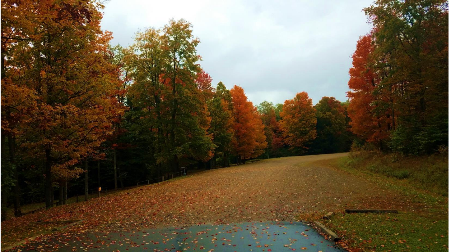
Exciting fall color can be found at Chapman State Park.

The district manager in Cornplanter State Forest District (Warren, Erie counties) reports that cooler nights have spurred fall colors in northwest Pennsylvania. Many oaks are still quite green, but maples (sugar and red) are displaying brilliant colors. Aspen, hickory, and birch are continuing to color the landscape with warm yellow hues. Route 6 to Chapman State Park is a recommended fall foliage corridor in Warren County.