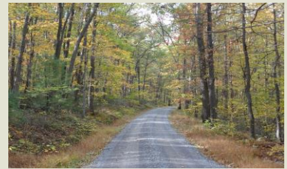
Colorful fall foliage peaks in October.