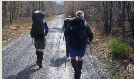
Hikers enjoying the Tuscarora Trail