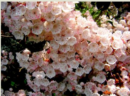
Mountain laurel, the Pa. state flower