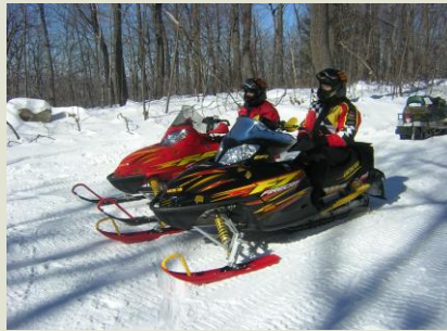
Riders enjoying snowmobile trail