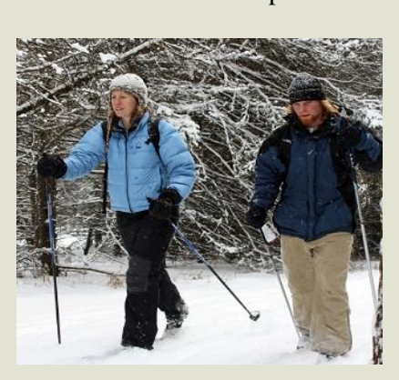
Cross-country skiers test their endurance.