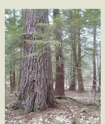
Old-growth hemlock forest