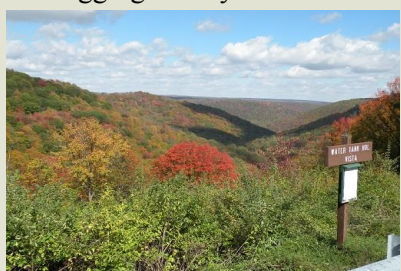
Water Tank Hollow vista