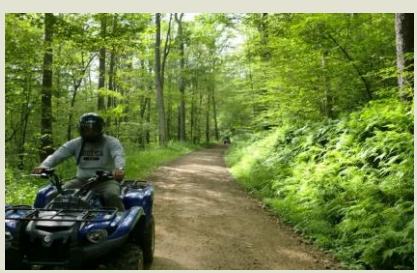
Rider enjoying ATV trail