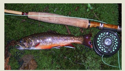
Native brook trout