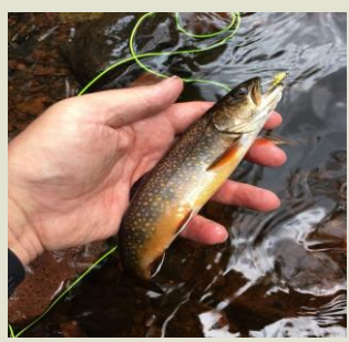
Native brook trout