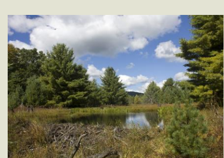
Cranberry Swamp Natural Area