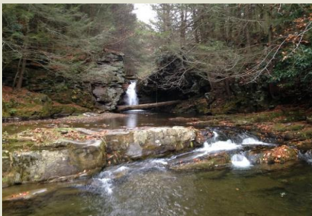
One of many waterfalls in Pinchot district