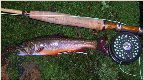
Native brook trout