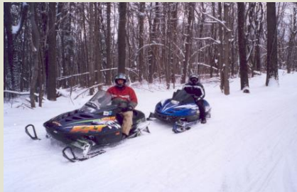
Riders enjoying snowmobile trail