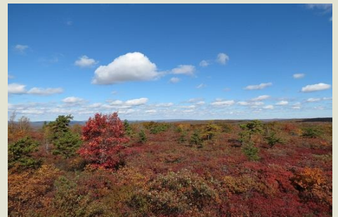
Pine Hill vista