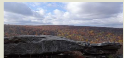
Colorful fall foliage at Wolf Rocks.