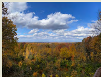
Beartown Rocks Overlook