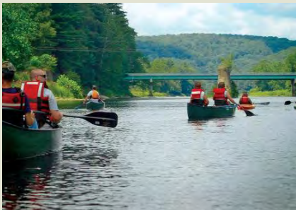
Canoeing the Clarion River