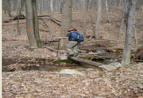
A hiker enjoying the Mid State Trail