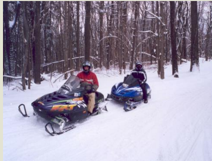
Riders enjoying snowmobile trail