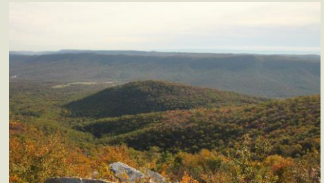
Colorful fall foliage peaks in October.