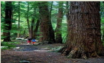
Old-growth hemlock forest