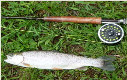
A beautiful rainbow trout taken at Penns Creek