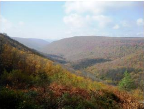
Rock Run Vista along Old Loggers Path

The Loyalsock State Forest contains about 115,000 acres, characterized by high plateaus and ridges cut with numerous deep stream valleys. Northern hardwood tree species, such as birch, beech and maple associated with black cherry, white ash, tulip-poplar and hemlock, fill the forest. The beauty of these hardwoods, combined with the spectacular topography provides for a diversity of forest based recreational opportunities.