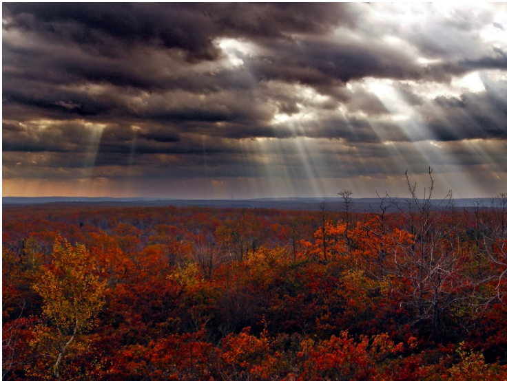
The Pine Hill Observation Deck offers an awe-inspiring view of the Pocono Plateau.

Choke Creek Nature Trail and Butler Run Trail can be used to form shorter loops with the southern portion of the Pinchot Trail.