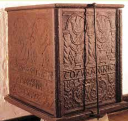
Mary Ann Furnace five-plate stove

The area of the park was originally inhabited by the Susquehannock people. They found ample hunting and fishing grounds along the Codorus Creek, whose name means "Rapid Waters". Wars with nearby Indigenous groups and the push of European settlers led to the demise of the Susquehannocks.