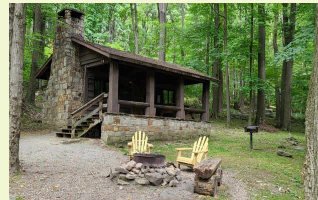
Rustic Cabin 9