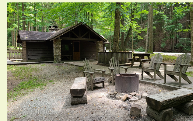
Modern Cabin 7