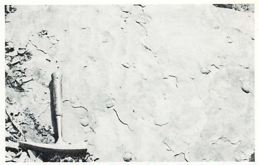
Fig. 3 Current-ripples in olive-gray, very fine grained sandstone of Lock Haven Formation at described site. Note brachiopod valves scattered convex-upward over surface of bed. (Current from right to left.)