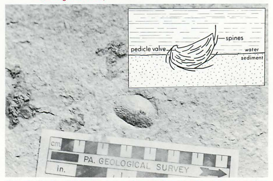
Fig. 4 Productella lachrymosa (Conrad) (internal mold of pedicle valve) on bedding surface. Insert in upper right shows this brachiopod in probable life position.