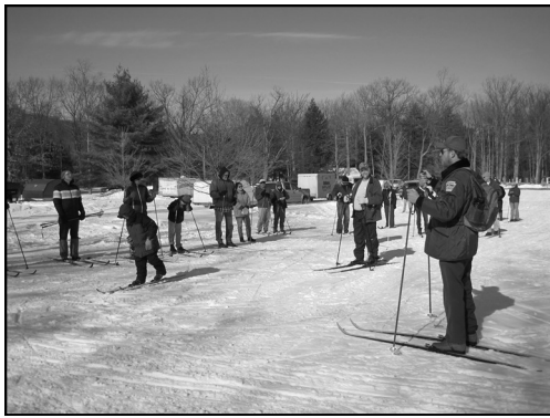
Learn to Cross-country Ski programs at the park provide opportunities to learn with equipment provided.

The whole family can come learn why cross-country skis work the way that they do, how to determine the proper-sized equipment, and then head outside to practice helpful techniques to get started like turns, falling down, and how to get back up. We provide equipment (limited-number and sizes) to both adults and children. Please dress appropriately for being active outdoors in the winter. Check the Events Calendar at www.visitPAparks.com ; there is a $3.00 fee to participate in this program.