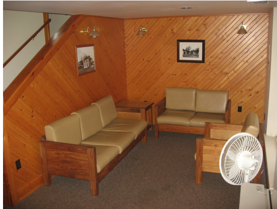
The living room has a couch, love seat, chair, and end tables.