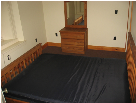
One bedroom has a queen bed and one bedroom has two sets of single bunk beds.

Guests should bring sheets, blankets or sleeping bags, pillows, etc.; all cooking, serving, and eating utensils; coffee pot; toaster; toiletries. Tents, camping trailers, and RVs are prohibited.