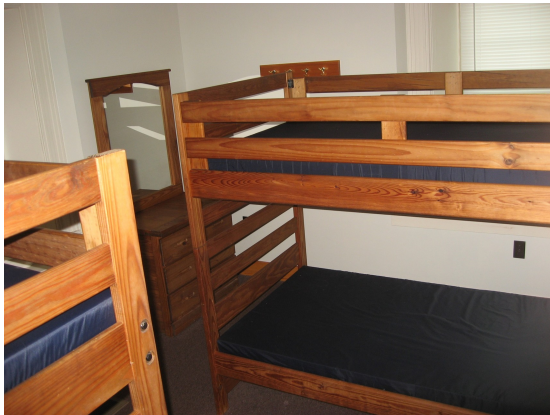
Outside there is a fire ring and picnic table.