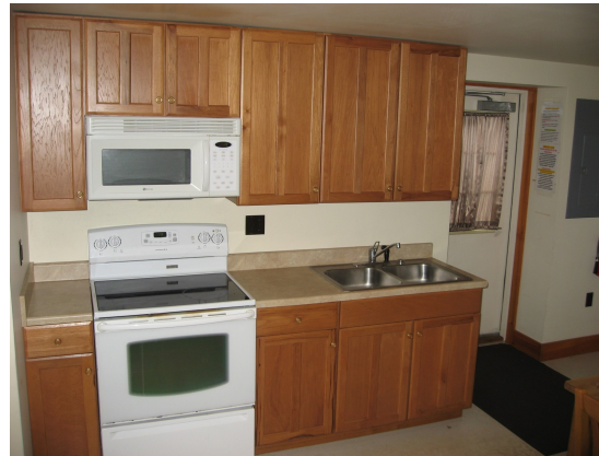
The kitchen and dining areas have a table, chairs, sink, refrigerator, stove/oven, and microwave.