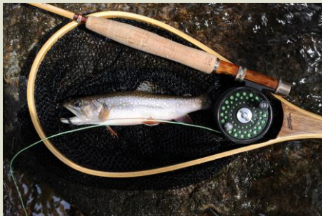
Native brook trout