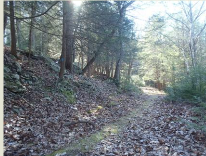
Stairway Lake Trail