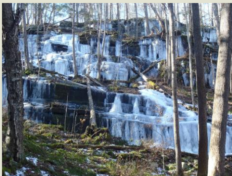
Cascading ice at Stairway Wild Area