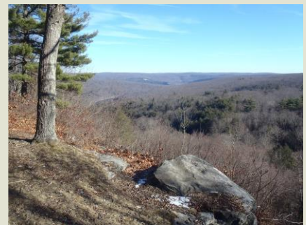
Stairway Wild Area vista