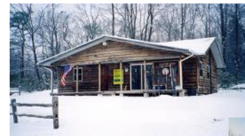
Laurel Mountain warming hut

The Laurel Summit Nordic Ski Patrol can be reached on the weekends during the winter by contacting the warming hut at: 724-238-6568.