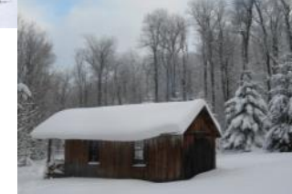
Schafer Run warming hut