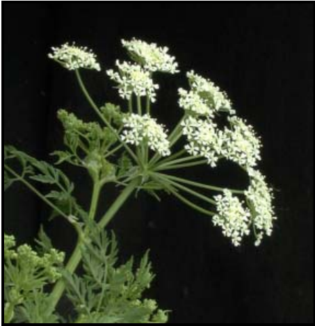
Pedro Tenorio-Lezama www.forestryimages.org