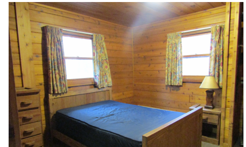
Master bedroom with double bed