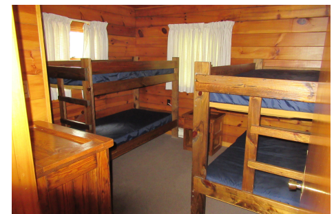
Bedroom with two sets of single bunk beds