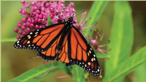
A monarch butterfly is one of many species that can be seen within the park.

Contact the park office or explore the online calendar of events, https://events.dcnr.pa.gov, for more information on programs and other learning experiences.