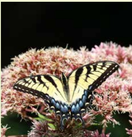
Tiger swallowtail butterfly on joe-pye-weed

Keystone State Park hosts a wide range of plant and animal life. The James A. Kell Visitor Center has a bird checklist and information about the natural sites and wildlife of the area. Each season provides an opportunity to see diverse plants and animals.