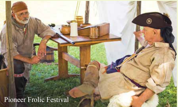
Pioneer Frolic Festival

The volunteer organization supports the state park with funding, volunteer projects, and sponsoring events such as the Pioneer Frolic Festival in June and Music at the Marina in August. Contact the park office for volunteering opportunities.