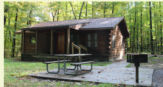
Jamestown Cabin 15