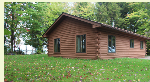
Linesville Cabin 21