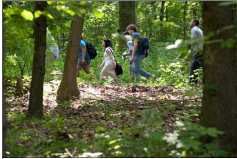
Exploring some of the 200 acres of wildlife habitat

Bayer also sponsors an annual International Summer Sustainability Camp where select high school students from the United States and Germany travel to Pittsburgh to learn from BASIC and WST volunteers about the effects of environmental sustainability and climate change.