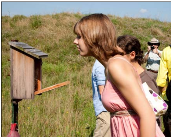
Students look inside one of the many on-site bluebird boxes

It was this commitment to sustainable development and the company's empowerment of their employees that prompted one staff member to contact the Wildlife Habitat Council (WHC) in 1997 to see how to better utilize their Pittsburgh campus for natural resource protection and environmental education. Bayer's Pittsburgh campus covers 300 acres; 200 of which are now managed as wildlife habitat in the form of deciduous forests, open meadows, ponds, and two natural wetlands. The WHC helped Bayer create a wildlife management plan to guide the onsite work.